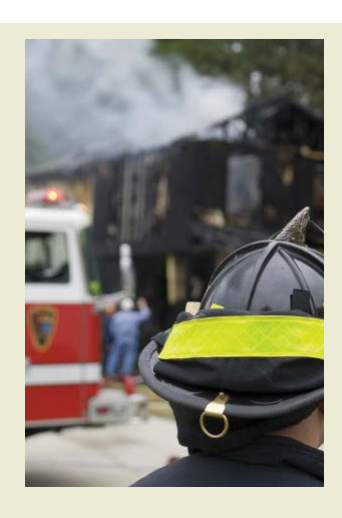
A list of federally declared disaster areas can be found at the Federal Emergency Management Agency (FEMA) website at fema.gov/disasters. Major disaster and emergency declarations in 2015 included areas in 30 states.